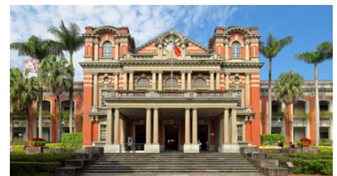
National Taiwan University