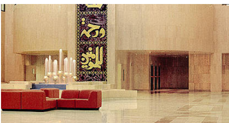
King Fahad Medical City