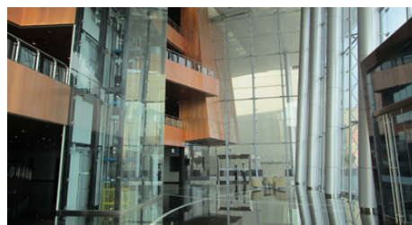
Grand National Theatre of Peru