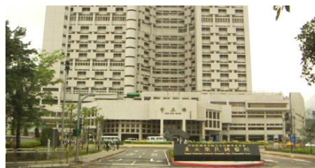
Taipei Veterans General Hospital