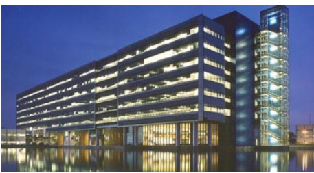
General Motors Vehicle Engineering Center