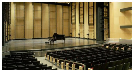
Detroit Public Schools Fine Arts High School