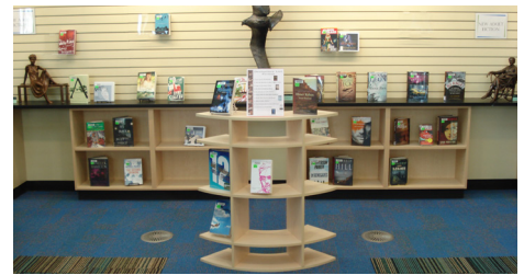
Pueblo West Library