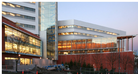
Bellevue City Hall