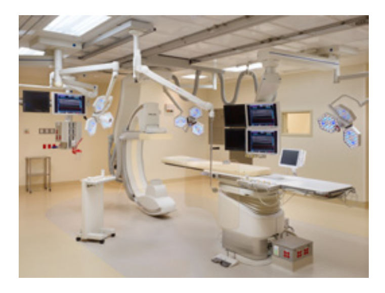
Unistrut in Hybrid Operating Room

The ceiling is precisely dimensioned to accommodate medical equipment tracks, lights, access panels, fill-in panels, and booms. The Unistrut® system is integrated with the HDCR ceiling, supporting the equipment tracks while sealing the room from the ceiling plenum above.