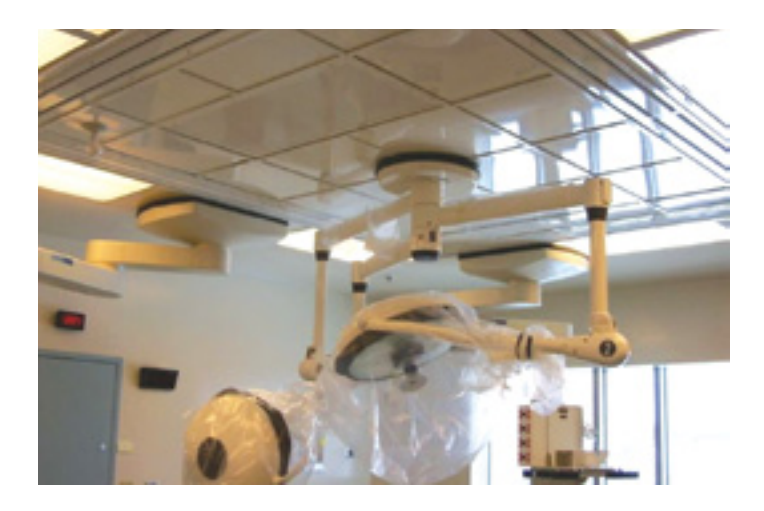
Unitee Cleanroom Ceiling System