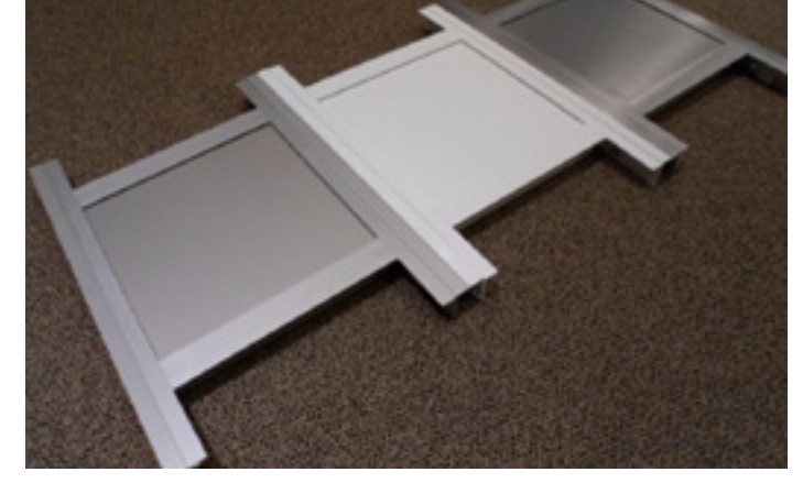
Anodized Finish, White Powder Coat Finish, Brushed Aluminum Finish (L-R)