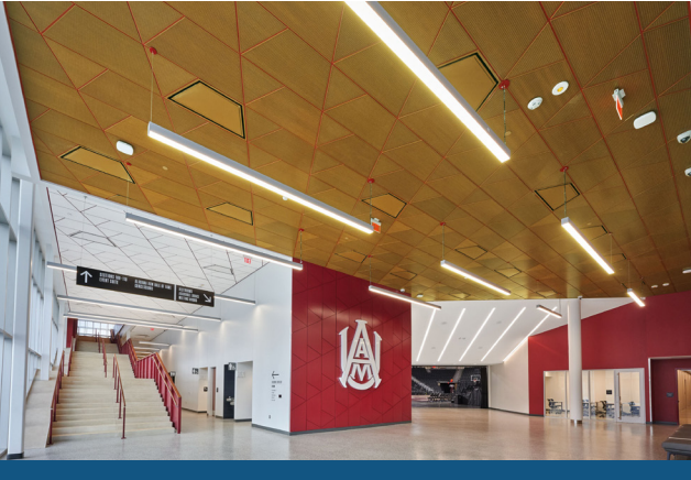
LINEAR SLOT DIFFUSER WITH MUD IN BORDER (CF OR SDS) in Armstrong Acoustibuilt Ceiling