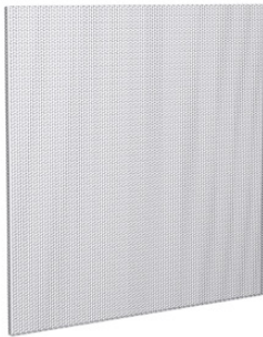
Aluminum Perforated Face Ceiling Panel (APFRF)