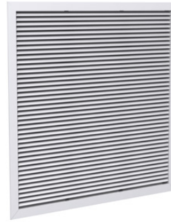
Aluminum Louvered Face Return Grille with 1/2 in. Blade Spacing (635/635FF)