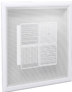
Perforated Supply Diffuser (PDS)