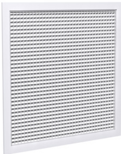
Aluminum, Sight Resistant Egg Crate Grille (85)