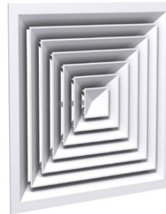
Aluminum Modular Core Diffuser (AMDE)