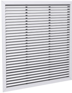
Aluminum Louvered Face Return Grille with 3/4 in. Blade Spacing (630/630FF)