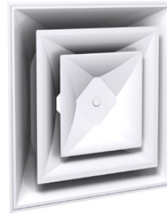
Aluminum, Adjustable Square Cone Diffuser (ASDA)