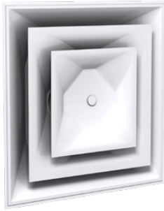
Aluminum Square Cone Diffuser (ASCD)