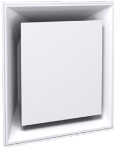
Aluminum Square Plaque Diffuser (ASPD)