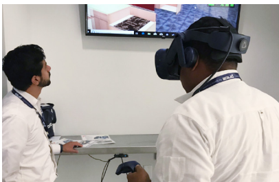
Price Fluid Reality