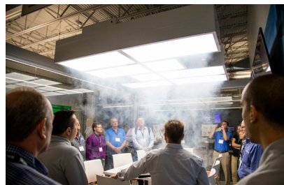
Surgical Suite Demonstration (Ultrasuite)