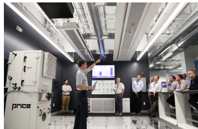
Stratified technologies (UFAD, Beams & Displacement)